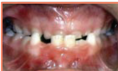
Complete Class III